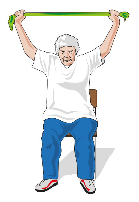
Figure 2. Rubberband exercise for back- och shouldermuscles.

Regular exercise of moderate intensity is healthy at any age but is particularly important in women after the age of 50 when changes in body composition become more apparent and the risk of disease increases. Physical inactivity is likely a greater risk factor for older individuals than for younger ones. Over the years, both women and men tend to gain weight, decline in muscle mass and muscle strength. In women, the risk of our most common diseases, such as cardiovascular disease, type 2 diabetes and osteoporosis, increases after menopause. Today there is evidence that regular physical activity counteracts climacteric symptoms, changes in weight, body composition and the risk of developing common chronic diseases associated with menopause (Figure 2 and 3).